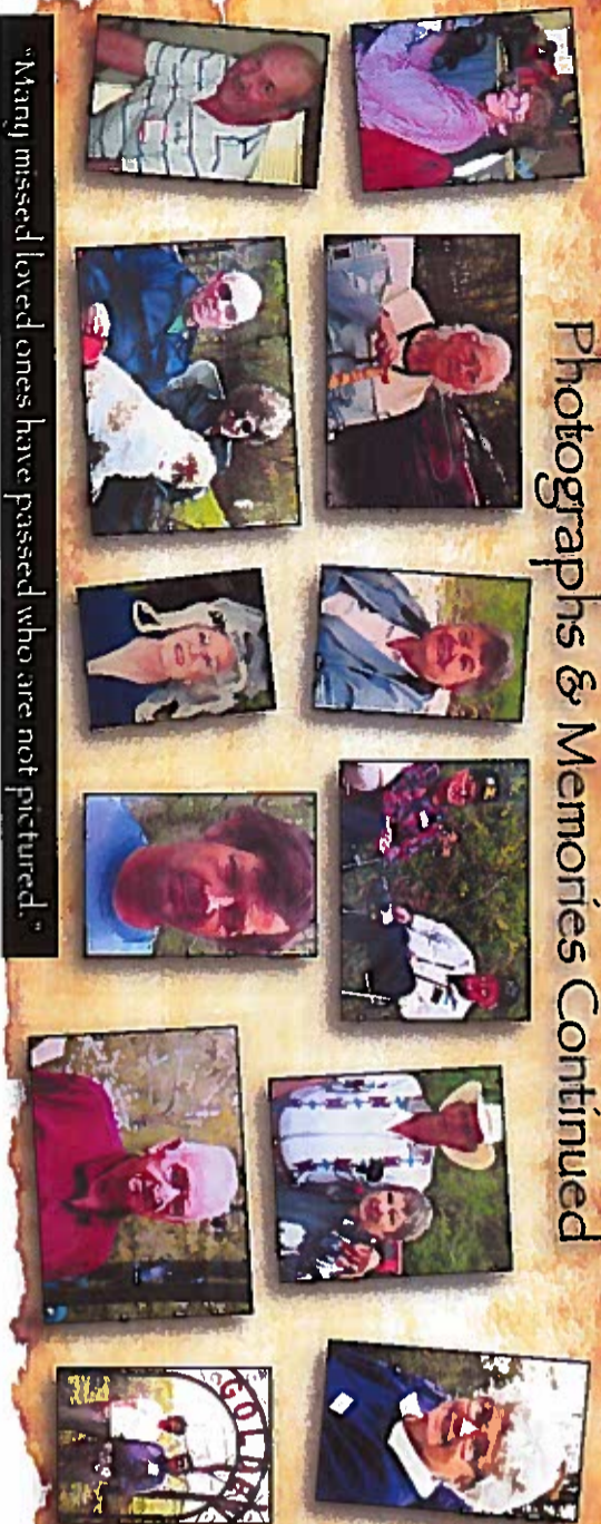
"Many missed loved ones have passed who are not pictured."